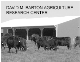
DAVID M. BARTON AGRICULTURE RESEARCH CENTER